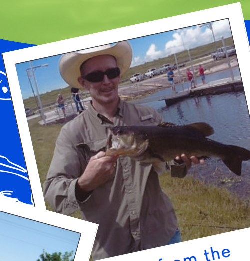
Bass from the Okeechobee